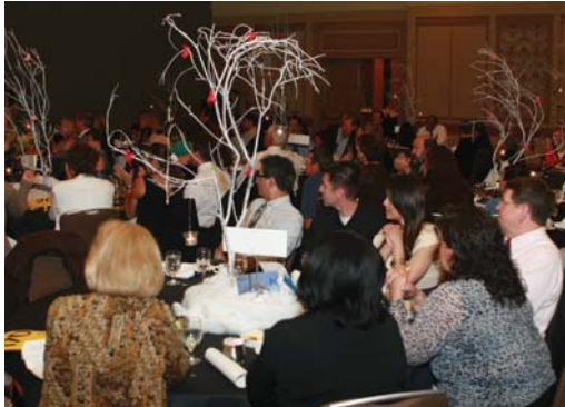
An attentive audience fills the room at the Hyatt Regency Monterey.